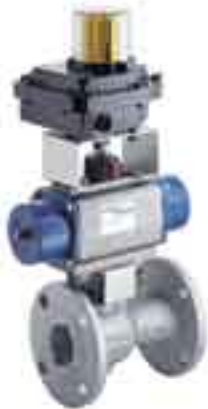
2" M40S ISO ball valve with actuator and limit switch box