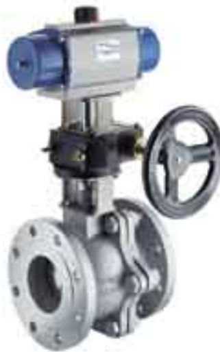
4" M31V ISO ball valve with pneumatic actuator and gearbox