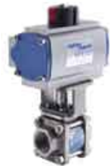
1" M10S ISO ball valve with actuator