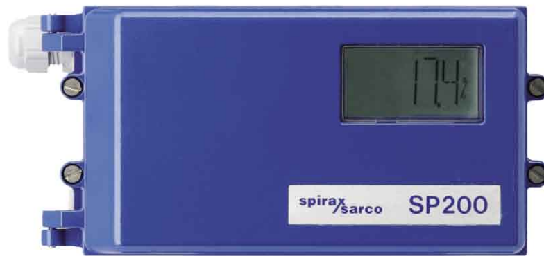
Electropneumatic smart positioner with gauge block