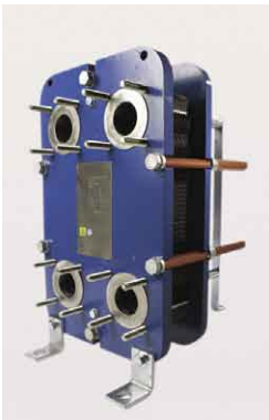
TS ® heat exchanger

With a Spirax Sarco heat exchange solution, our high quality equipment is used for the vital steam control and condensate removal functions, which are necessary to provide accurate, and safe control.