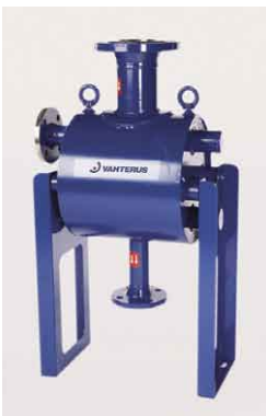
Plate & Shell ® heat exchanger

We have a dedicated team with expertise in all elements of steam heat exchange and its application. We will provide you with a single point of contact for your heat exchange solution, without the need for you to provide your own engineering resource or manage multiple suppliers, therefore saving you time and money.