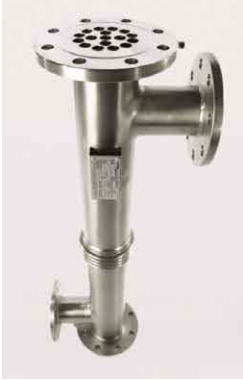
Series Vs heat exchanger